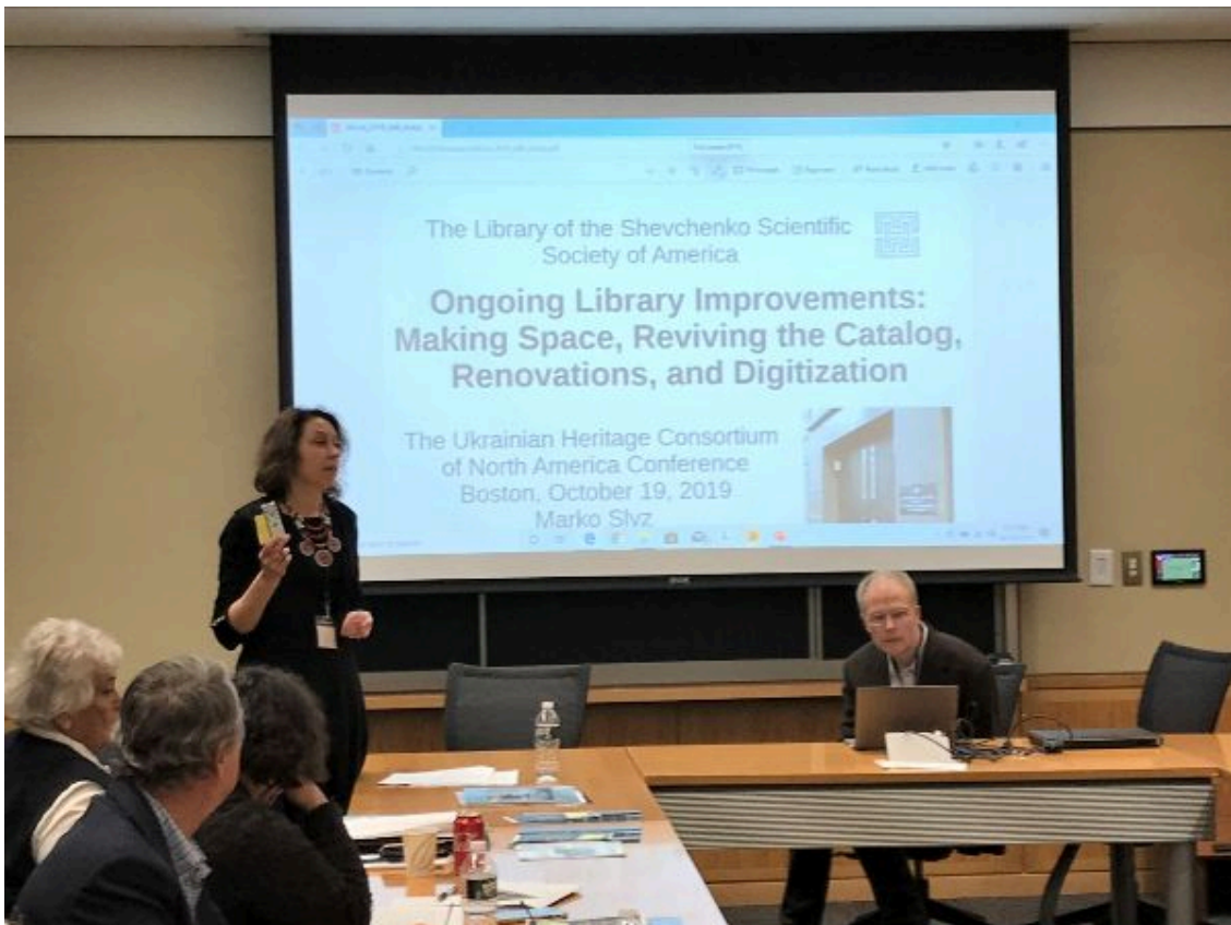
Society Members Attend a Meeting of the Ukrainian Heritage Consortium at Harvard