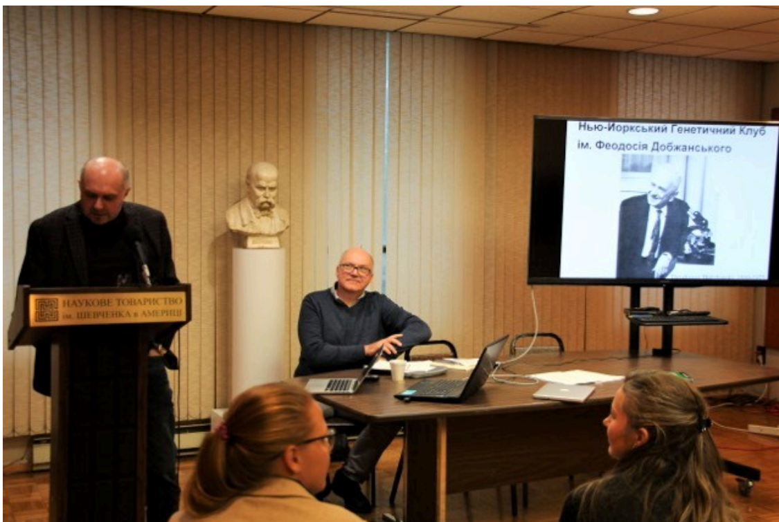
The Creation of the Dobzhansky Genetics Club

For a video recording of the event, click here